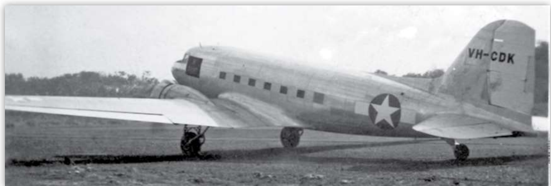
C-50 callsign VHCDK, the subject of Profile 71, at the eastern end of Seven-Mile 'drome in late 1944 after it was stripped down to natural finish and given field number W7697.