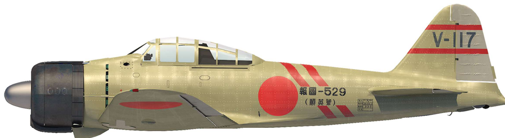
A6M Model 21 Zero V-117, CN 2641, Tainan Ku chutaicho Lieutenant Yamashita Joji shot down Milne Bay 27 August 1942.