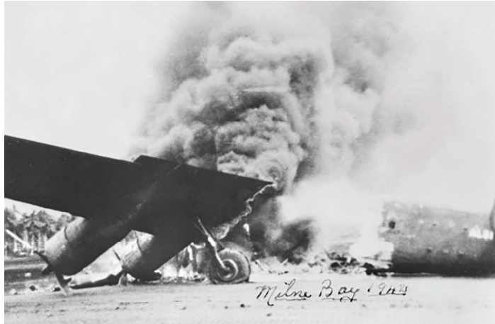
LB-30 Liberator AL515 Yard Bird burns after being strafed by Zeros on No. 1 Strip, Milne Bay, 27 August 1942.