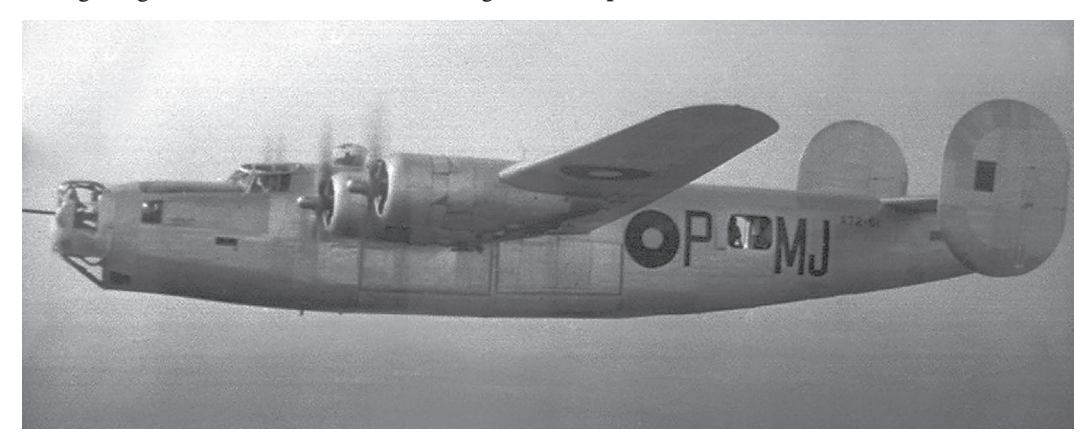
RAAF Liberator A72-61, identified as part of No. 21 Squadron because of the "MJ" fuselage code. No. 21 Squadron became operational at Fenton in January 1945. (Bob Livingstone)

Bombed secondary tgt Kairotoe strip ... 48 \times 100 lb demos. All bombs in strip area – nil sightings – 2 bursts of A-A from Village near strip.