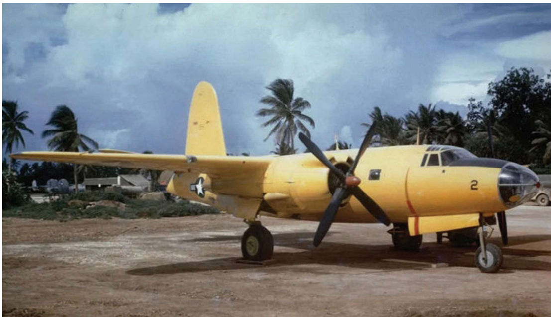
A colour photo of a JM-1 from an unidentified utility squadron at Pityilu.