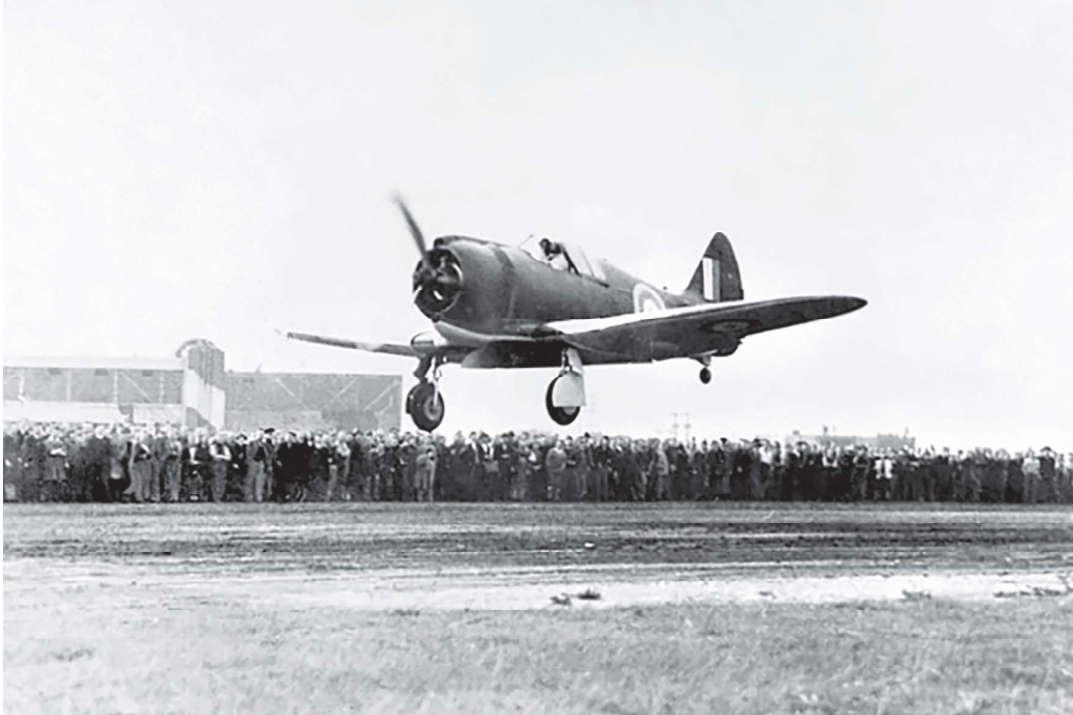
The maiden flight of the Boomerang took place on 29 May 1942 in front of a large crowd of CAC factory workers and their families.