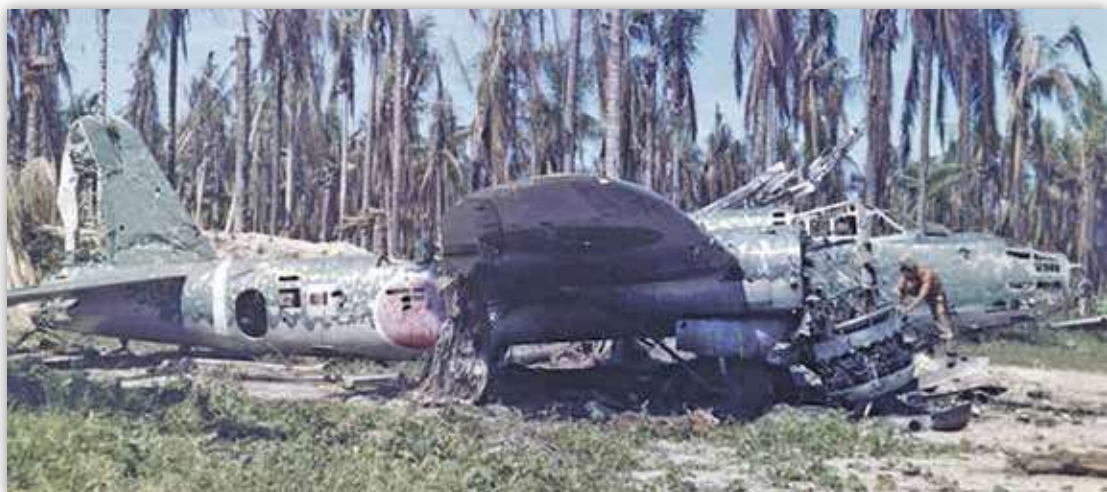
This late model Ki-49-II was captured at Wakde.