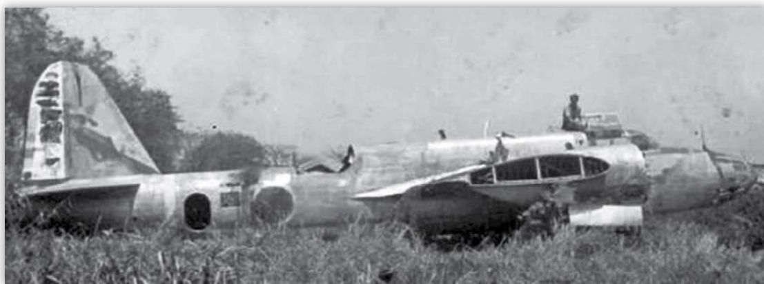
The early unit insignia is displayed on this Ki-49 found at Hollandia and the subject of Profile 36.