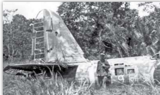
Hokoku 1249 patriotic donation Ki-49-II Donryu abandoned at Hollandia.