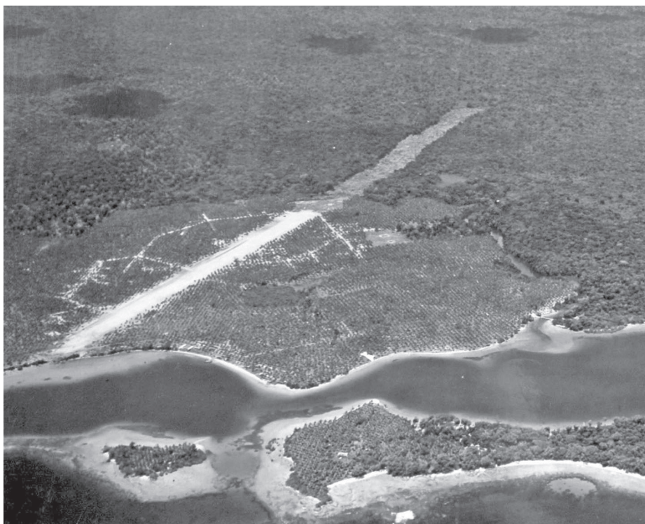
Taken on 17 November 1942, this aerial photo shows the newly constructed Turtle Bay airfield on Espiritu Santo.