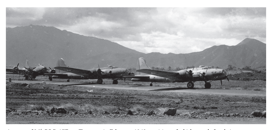
A group of 26^{th} BS B-17Es at Tontouta in February 1943 awaiting refurbishment before being redistributed between other 5^{th} BG squadrons.