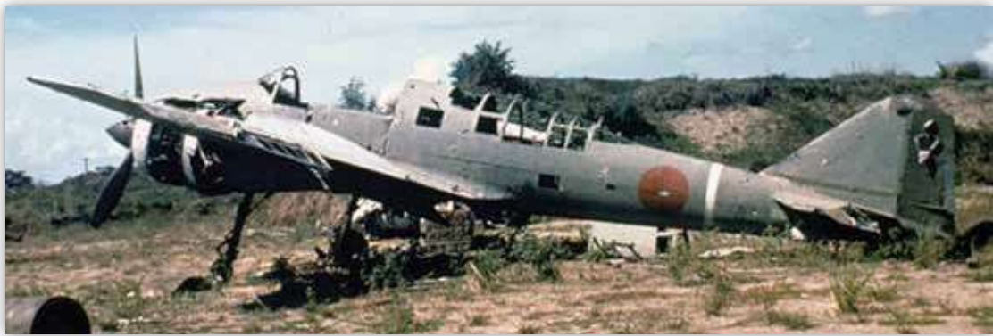
The common Mitsubishi light grey as applied to all Mitsubishi Ki-46-IIs is displayed on this captured example in the Philippines.