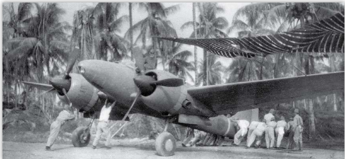
Ground crew push a Ki-46-II from an unidentified reconnaissance unit under a camouflage net at But 'drome sometime in 1943.