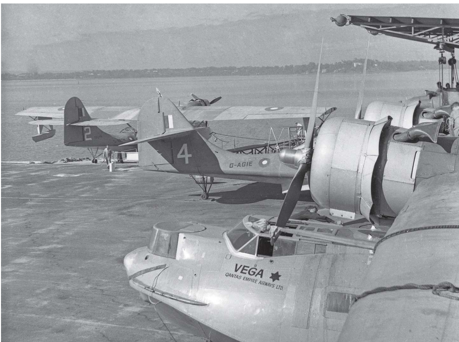
A 1944 view of the Qantas Empire Airways flying boat base on the Swan River at Nedlands, Perth, showing the slipway eventually completed via a DCA works order.