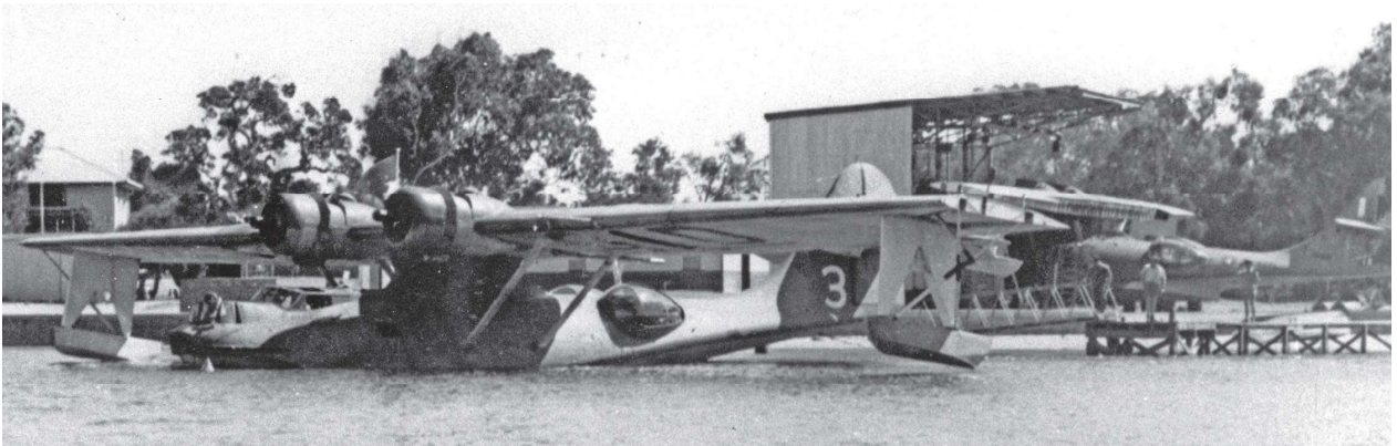
The Qantas Nedlands flying boat base in 1944, showing the tall maintenance hangar behind the jetty. The moored Catalina in the foreground is G-AGID.