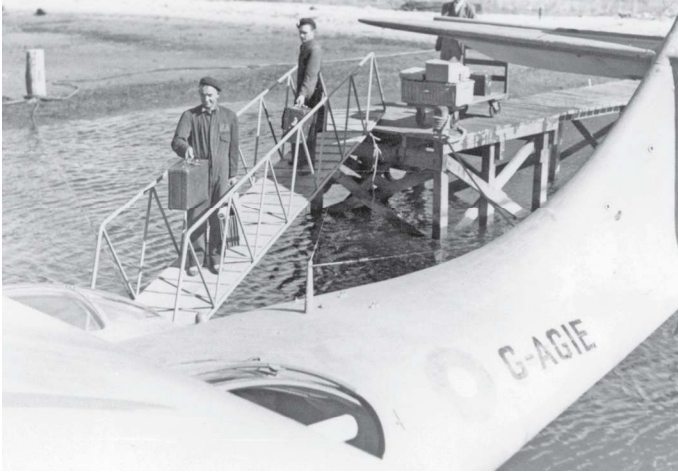
G-AGIE being prepared for departure at Nedlands, showing the "Barker Bridge" extension to the jetty, which also carried the refuelling hose.