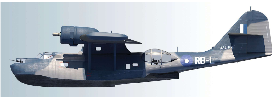
PBY-5 A24-59 (RB-L) as serving with No. 20 Squadron in early 1944. It has two tone (Dark Ocean Blue and Extra Dark Sea Grey) camouflage and Night Black under surfaces.

The first of these minelaying sub-campaigns commenced on 22 April 1943 when eight aircraft from Nos. 11 and 20 Squadrons took off from Cairns to drop sixteen mines in Silver Sound, in the approaches to Kavieng harbour.