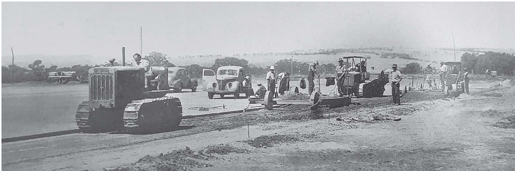
Runway construction work underway at Gawler in early 1943.