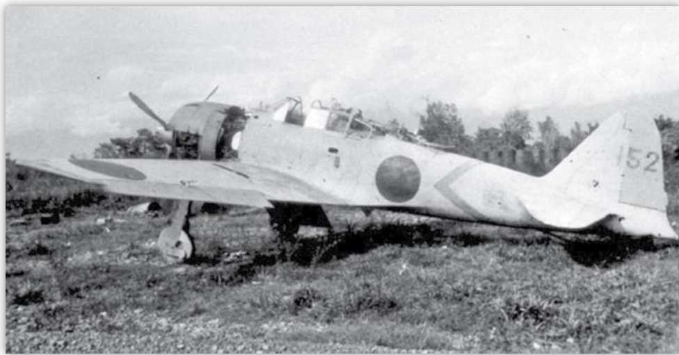
Tail code 152 as captured at Lae and as illustrated in Profile 83.