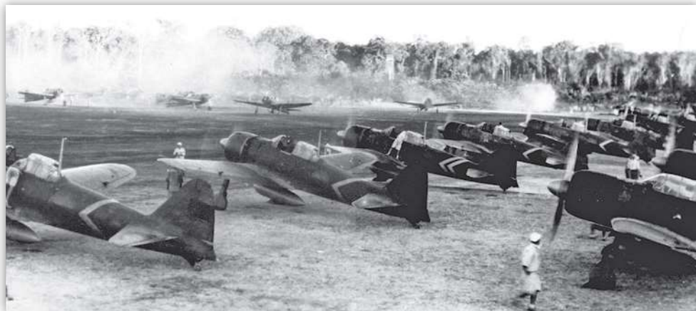
A line-up of a mixture of Model 21 and Model 22 Zeros at Buin in April 1943 during Operation I-Go.