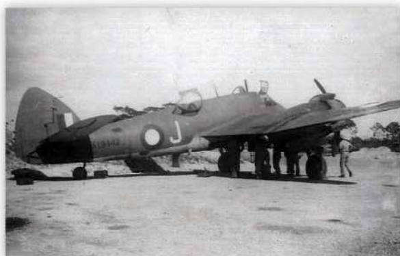
Beaufighter A19-142 which was flown by Wing Commander Emerton over Tobera on 12 October 1942.