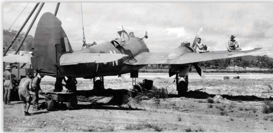
Beaufighter A19-97 about to receive a replacement rudder at Wards 'drome on 10 May 1943, about five months before it was lost.