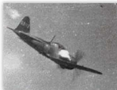
Model 22 Zero tail code 53-112 of No. 253 Ku aflame over Rabaul in late 1943 as captured on gun camera.