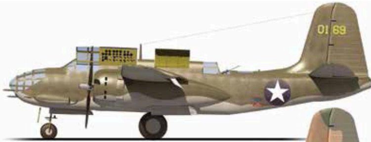
A-20A serial #40-169 89th Bombardment Squadron Sydney: April 1942