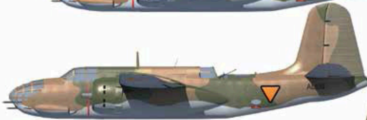
Douglas DB-7A AL898 No. 18 Squadron RAAF (NEI): April 1942