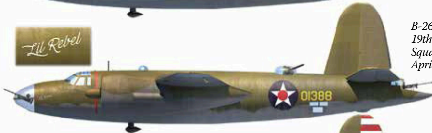
B-26 serial #40-1388 19th Bombardment Squadron, Garbutt: April 1942