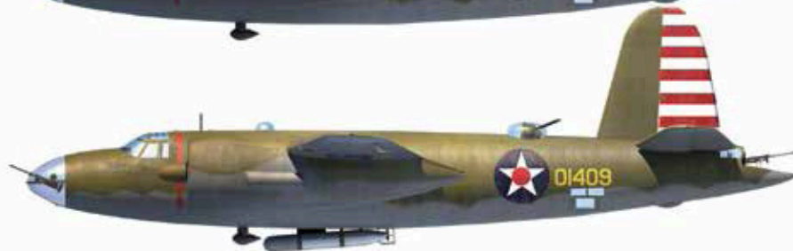
B-26 serial #40-1409 19th Bombardment Squadron Experimental torpedo training, Nowra, New South Wales: March 1942