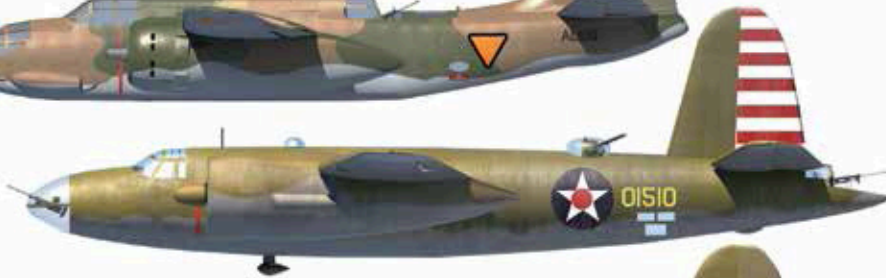
B-26 serial #40-1510 2nd Bombardment Squadron