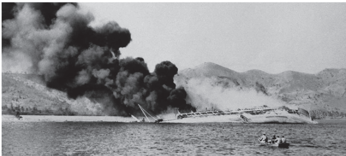
The smouldering wreck of the Macdhui, soon after it ran aground on a reef and rolled over.